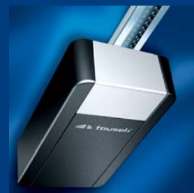
tousek garage doors operators convenient and safe

Subject to changes in design, composition, technical alterations and printing errors. All contents are protected by copyright. Reprinting, digital reproduction, in whole or in part, without our written permission is forbidden.