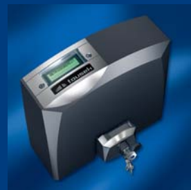
tousek sliding-gate operators compact and safe