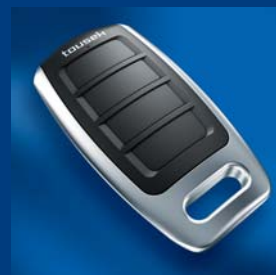
tousek impulse emitter programmes compatible and secure