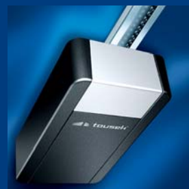
tousek garage doors operators convenient and safe

Subject to changes in design, composition, technical alterations and printing errors. All contents are protected by copyright. Reprinting, digital reproduction, in whole or in part, without our written permission is forbidden.