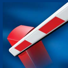
tousek barrier systems attractive and robust